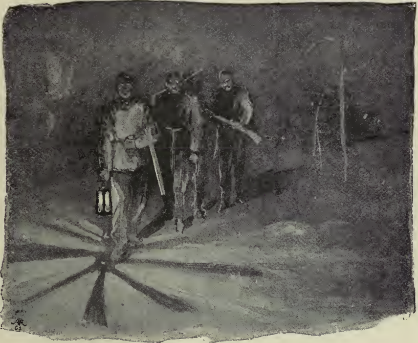
I SAW THE LIGHT FROM THE LANTERN.

' Rather! ' replied the nearest of the three spectres in pyjamas, Mr. Jones.